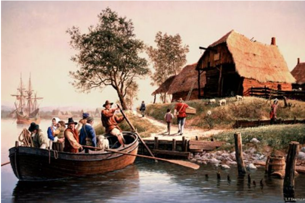
The Ferry , by Len Tantillo