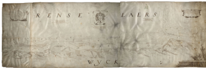
Map of Rensselaerswyck by Gillis van Scheyndel, ca. 1632

The three maps below each show unique information about Rensselaerswijck: where it was located, what the terrain looked like, and how it would fit into modern-day New York State.