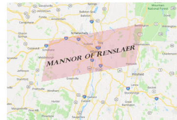
For a modern perspective, view this map of New York's Capital District with an overlay of the patroonship.