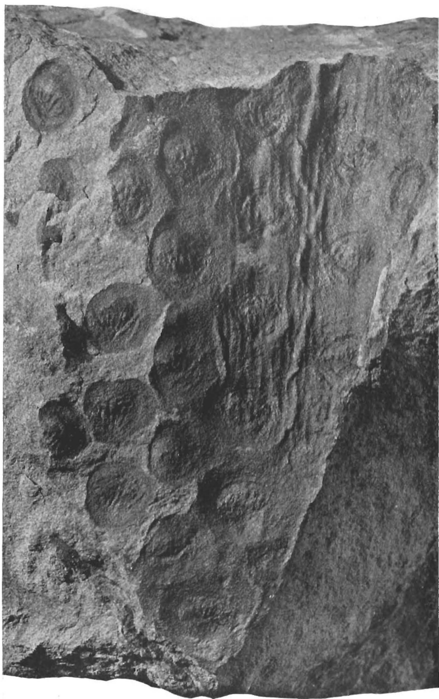
Eospermatopteris . Specimen showing petiolar scars. Natural size.