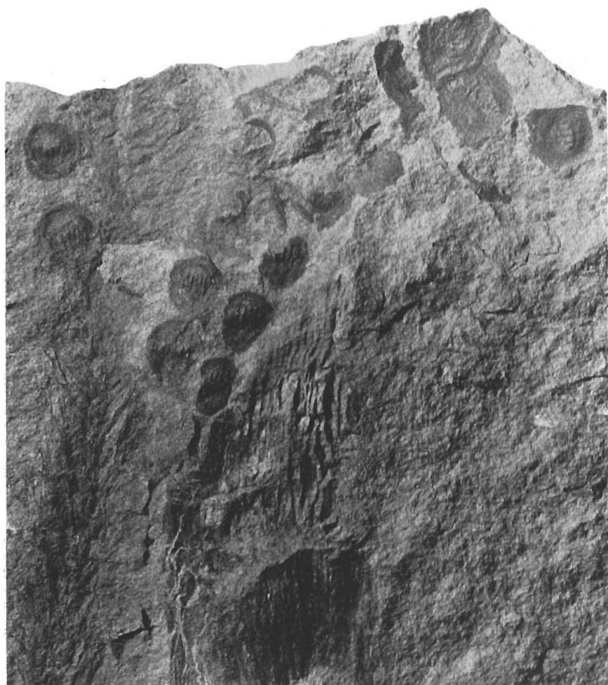
Eospermatopteris Specimen showing petiolar scars and some cortical tissue. About two thirds natural size.