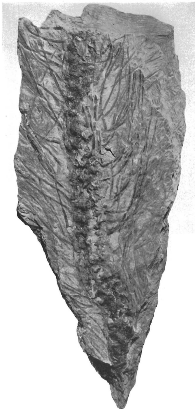
Sigillaria (?) gilboensis sp. nov. Portion of trunk with long grasslike leaves. About one-fourth natural size.