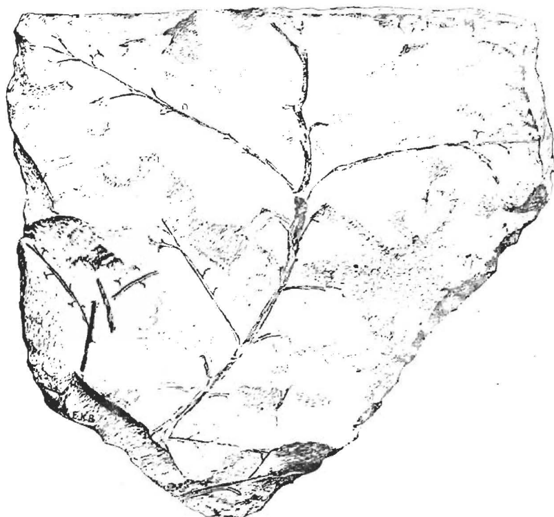
Fig. 3 Part of main rachis and lateral branches of the frond of Eospermatopteris . The slab has a greatest width and length of 2 feet.

divisions are alternately arranged: no indication has been found of the occurrence of dichotomous divisions in the upper part of the fronds, as mentioned by Dawson ( see page 57) under his description of Caulopteris lockwoodi . This specimen of " Caulopteris lockwoodi " is the only clue we have as to the character of the petioles and the arrangement of the fronds upon the trunk. The petioles are described as slender and much expanded at the base and spirally arranged in about five ranks ( see figure 1). Many of