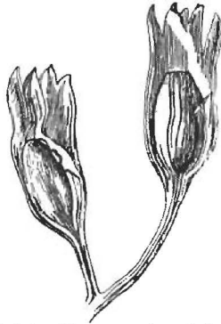
Fig. 5 Lagenostoma sinclairi . Two seeds of Lyginopteris enclosed in lobed cupules, and borne terminally on branches of the rachis, \times 3\frac{1}{3} . (From Scott, 1909, after Arber)

almost to the seed. Some specimens show fine lines on the cupule which may mark the position of fibro-vascular bundles. The seed (plate 10, figures 6, 9, 11, 12; plate 11, figures 1, 2) is broadly oval to round; the impression of it is very distinctly shown in the larger and older fructifications, and can be distinguished even in the immature ones (plate 10, figure 5). The measurements of some of the larger seeds are as follows: 5.3mm x 2.5mm; 5.6mm x 3.1mm; 6.4mm x 3.4mm; 6.3mm x 3.4mm. On several slabs were found groups of small rounded thick bodies, some of them free, others attached to pedicels, plate 11, figures 3-5, which have every appearance of being seeds. The largest of these bodies vary from a length and width of 3mm to a length of 3.2mm and a width of 2.7mm.