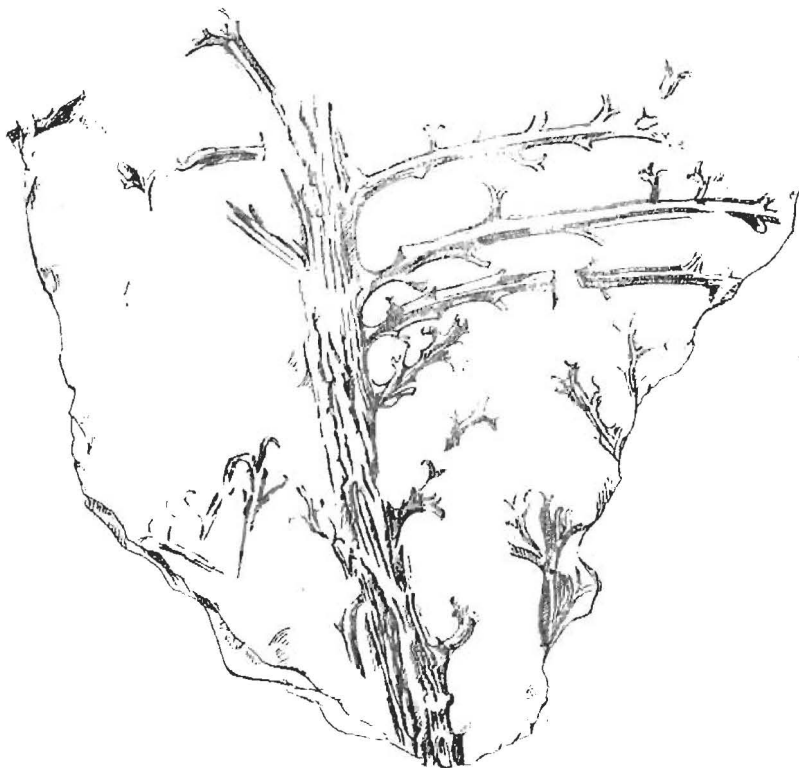
Fig. 4 Part of the frond of Eospermatopteris showing the ultimate pinnae with the pinnules. (Reduced slightly more than one-third)

keilhau described by Nathorst 20 from the Upper Devonian of Bear Island. A stronger resemblance is shown to certain sterile leaf segments from the same locality, correlated by Nathorst with Cephalopteris ( Cephalotheca ) mirabilis 21 which will be treated more fully under the discussion of the seeds and microsporangia. The character of the pinnules is shown in