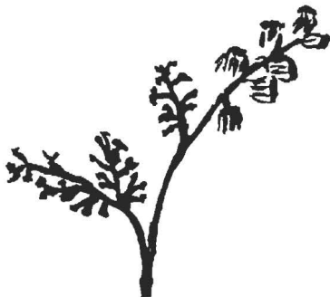
Fig. 7 Crossotheca hönninghausi . Fertile pinnae in connection with sterile pinnae of Sphenopteris hönninghausi , the leaf of Lyginopteris . (x2)

Up until 1905, nothing was known of the male fructifications of the Pteridospermophytes; but during that year Doctor Kidston 23 discovered a species of Crossotheca ( C. hönninghausi , Kidston) in connection with the foliage of Lyginopteris ( Sphenopteris hönninghausi ). The fertile pinnules are oval in form, measure about 2-2.5mm in length and bear six, rarely seven, bilocular sporangia. 24 The sporangia which are convergent when young, spread out at maturity assuming a fringelike arrangement, which gives to the sorus the form of an epaulet (figure 7).