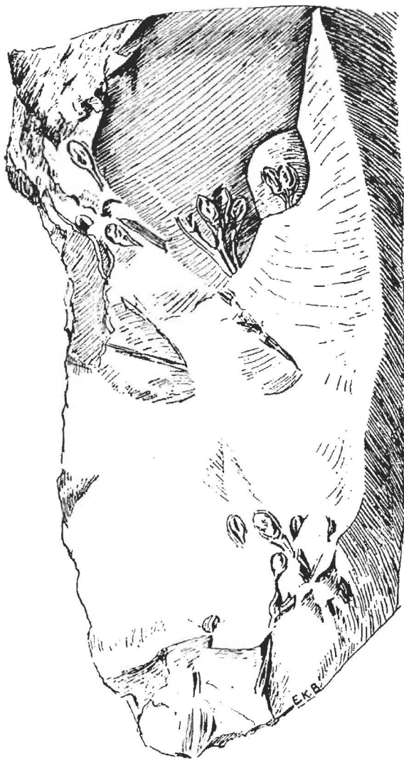
Fig. 6 Slab showing groups of seeds of Eospermatopteris . The seeds are borne in pairs at the ends of forked branchlets. (x1)